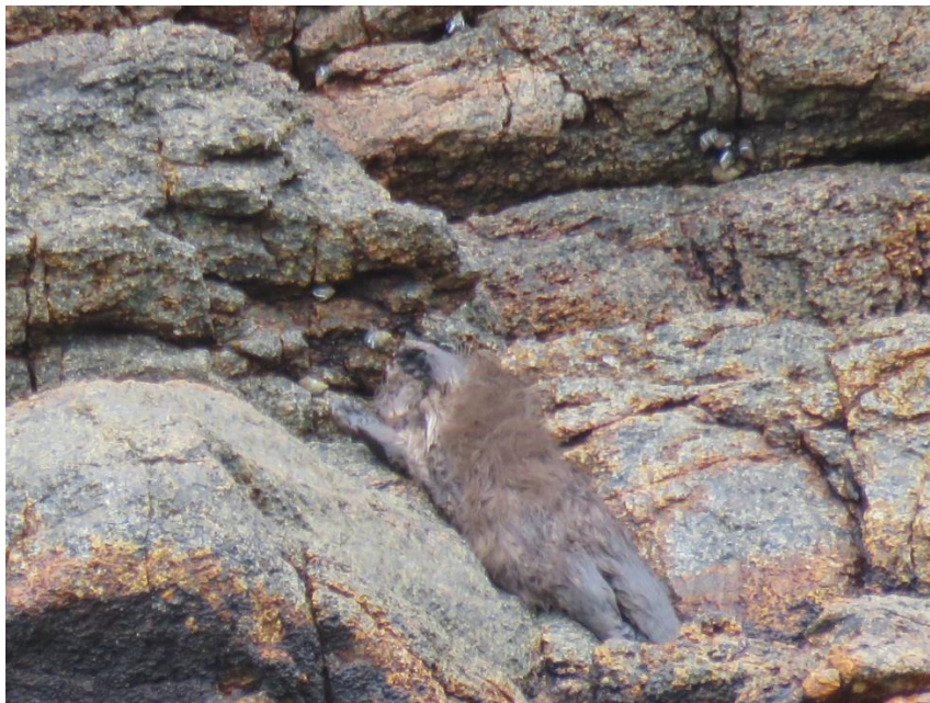
Figure 2. Dead cub otter due to attack of dogs. Puchuncaví, Valparaíso, Chile 31 December 2016.