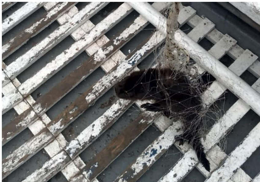
Figure 3. Entangled cub in fishing gear. Quintero Bay, Valparaíso, Chile. 5 March 2019.